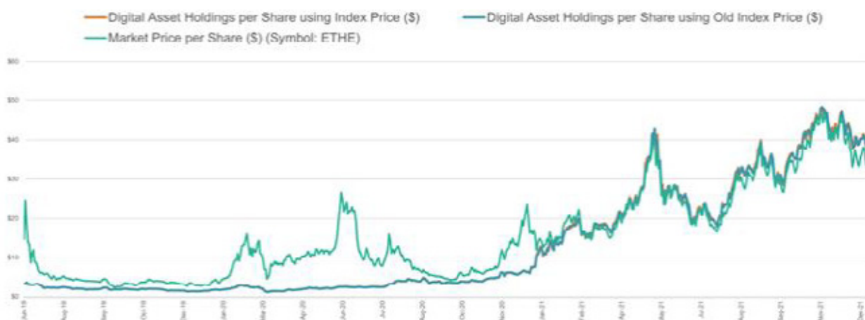
ETHE Premium/(Discount): ETHE Share Price vs. Digital Asset Holdings per Share ($)

The following chart sets out the historical premium and discount for the Shares as reported by OTCQX and the Trust's Digital Asset Holdings per Share based on the Index Price and the Old Index Price.